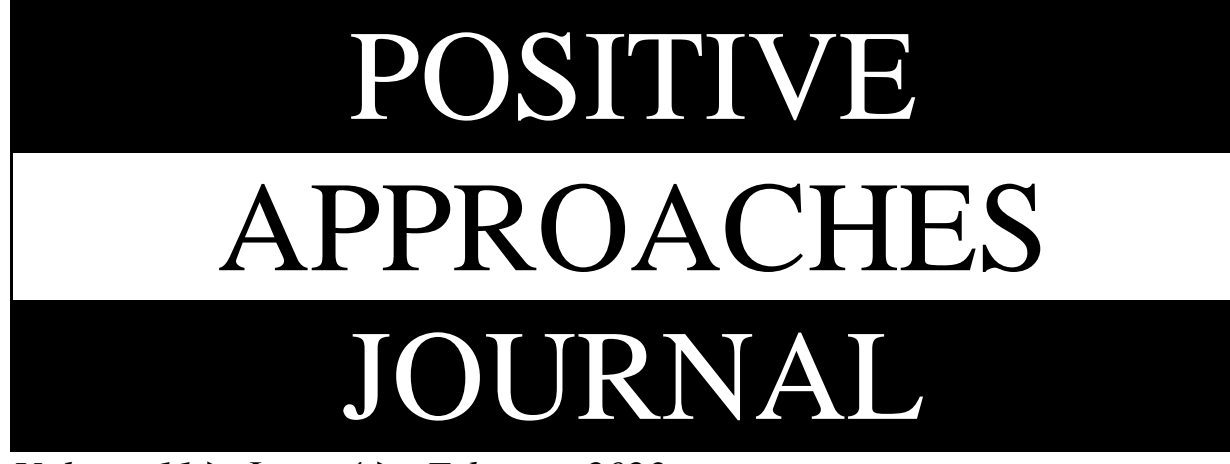
Volume 11 ► Issue 4 ► February 2023